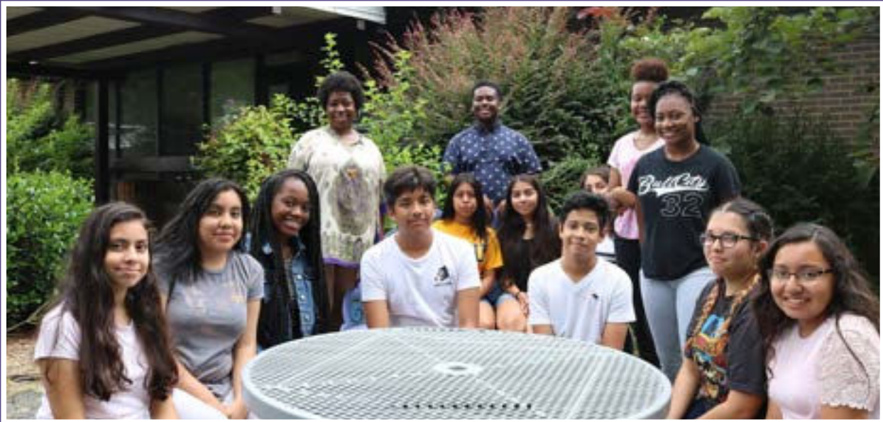
Student U Summer Academy “Voices of Student U” Program 2018

We believe that in order to change the system and change outcomes, we must change the narrative around our community.