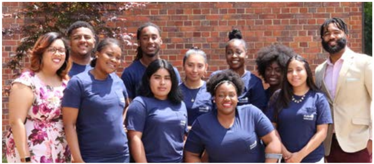
2018 Student U College Promise Leadership Fellows

Student U launched the College Promise Leadership Fellowship to expand our reach and support for college freshmen while also developing the leadership skills of upperclassmen mentors. Student U hires its own experienced college students as College Promise Leadership Fellows, who are paid to mentor and support the younger college students on their respective campuses. Since implementing this program, we have seen a stronger peer network that smooths the transition to college and increases engagement of freshmen, while being an opportunity for students to be leaders and critical agents in the success of their peers.