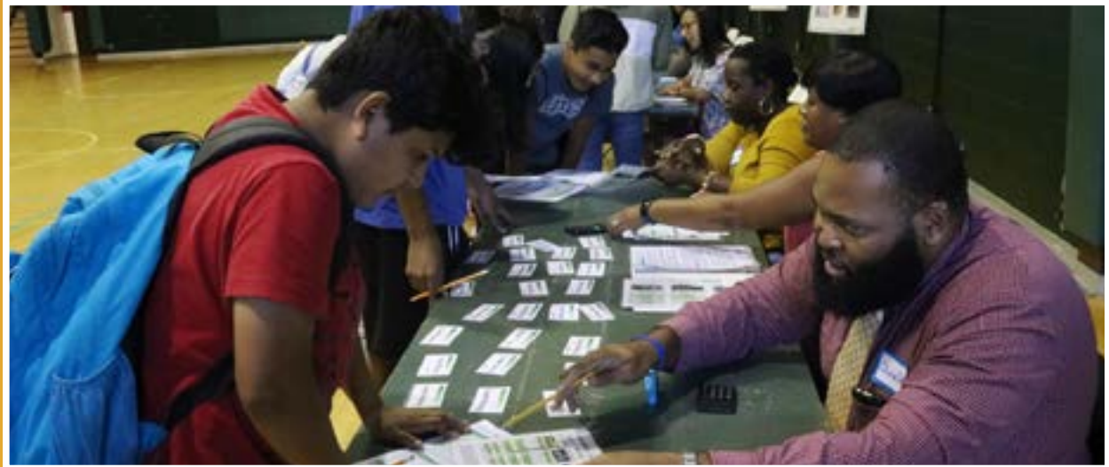
State Employees Credit Union's Reality of Money Event

In 2018, we launched a College Savings Program to support our families in raising $2550 before students leave for college. Student U is partnering with the Latino Community Credit Union (LCCU) to open College Savings Accounts for all of our middle school students.