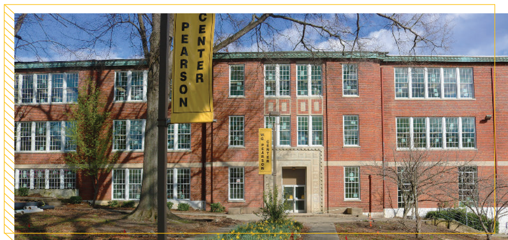
W.G. Pearson Center currently undergoing renovations. 600 E Umstead St, Durham, 27701

* The W.G. Pearson project will be fully funded without incurring any debt.