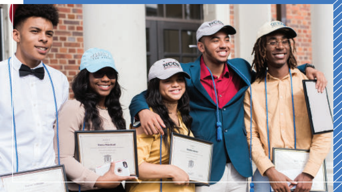
Student U Class of 2017 at College Signing Day

As a result of structural racism, poverty, and other systemic injustices, first-generation college-bound students face significant personal and institutional obstacles to educational success. This situation prevents our community from reaching its full potential.