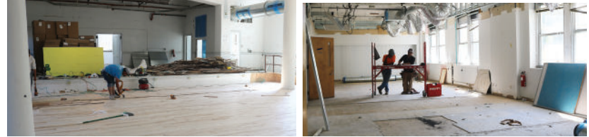
Left: W.G. Pearson Center Auditorium Renovation Right: W.G. Pearson Center Classroom Renovation

Student U will make the historic W.G. Pearson Center its home in the fall of 2018. Through partnerships with Durham County and Self-Help, renovations are underway and soon Student U will be the master tenant.