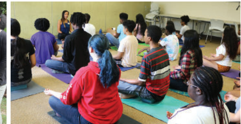
Left: Girls on FIRE Summer Academy 2017 Right: Professional Development Friday for HS Interns