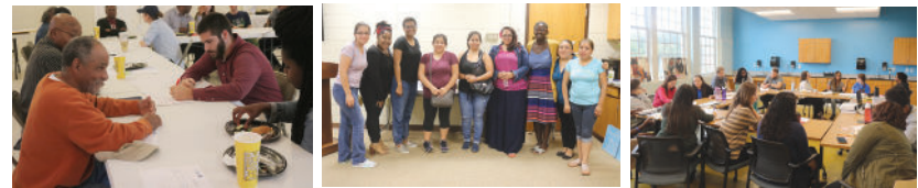
Left to Right: Neighborhood Community Meeting, Student U Parent Meeting, Full-time Staff Meeting

Over the past two years, we have held a number of community meetings to create a collective vision for W.G. Pearson. Our hope is for W.G. Pearson to be a welcoming space for students, families, neighbors and community organizations.